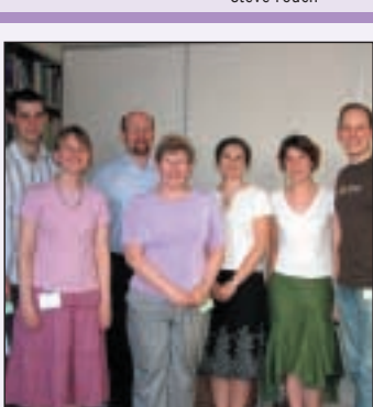
CNM Executive Committee

The Christian Therapists' Network (CTN) is going through a time of change, with a new leadership structure, a new regional structure, and a new leadership Council. One of the big challenges is how to support